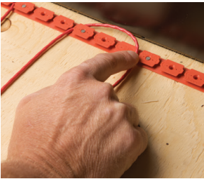
Install Nuheat Cable