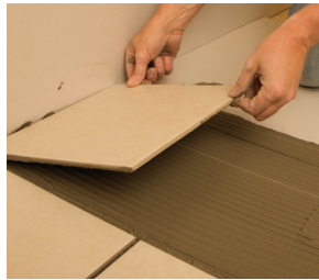
Trowel Thinset and Install Tile