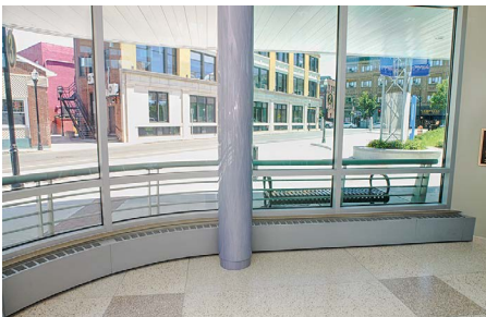
Perimeter Heat with Baseboards