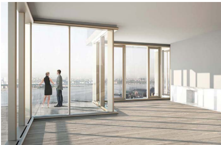
Perimeter Heat with nVent NUHEAT