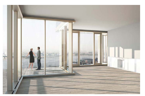
Perimeter Heat with nVent NUHEAT