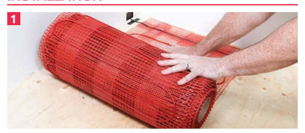
Roll out adhesive mesh