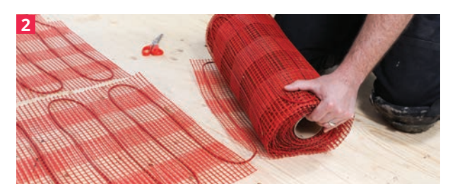
Cut and turn to fit room shape