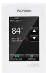
Nuheat Home thermostat