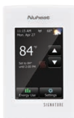
Nuheat Signature thermostat