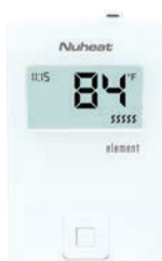
Nuheat Element thermostat