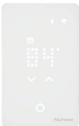
Nuheat Conductor thermostat

Control your line voltage electrical heating system with Nuheat's premium range of controllers.