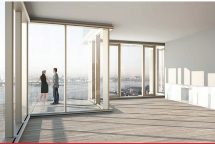
Perimeter Heat with nVent NUHEAT

nVent NUHEAT electric radiant heating systems are ideal for Perimeter Heat applications. NUHEAT systems offer an invisible alternative to baseboard heaters for heat loss replacement on curtain walls.