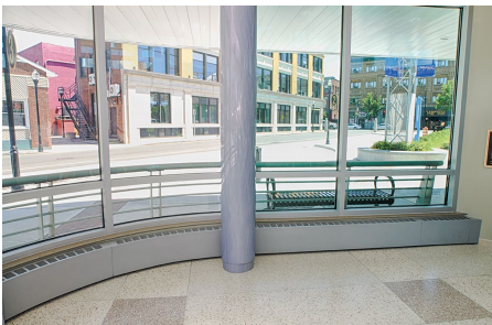
Perimeter Heat with Baseboards

NUHEAT Mats are installed beneath the finished floor, offering a silent and invisible perimeter heat solution.